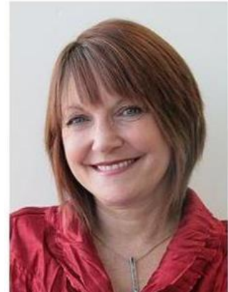
Lynne Pillay Labour MP

Labour Spokesperson for Disability Issues Associate Labour Spokesperson Justice - Victim Rights