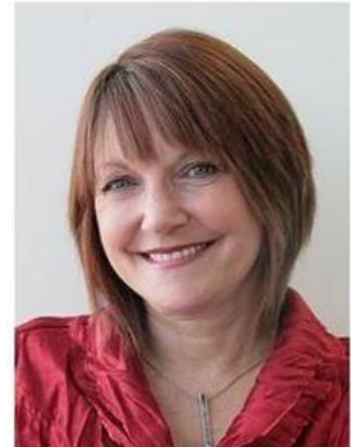
Lynne Pillay Labour MP

Labour Spokesperson for Disability Issues Associate Labour Spokesperson Justice – Victim's Rights